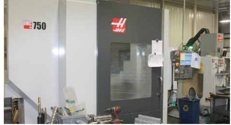
Above: A Haas UMC-750 5-Axis machining center at Creative Blow Mold. Find video at the company's website: http://creativeblowmold.com/5-axismachining-advanced-technology/

Creative Blow Mold Tooling serves a wide range of industries including: food/beverage; automo-